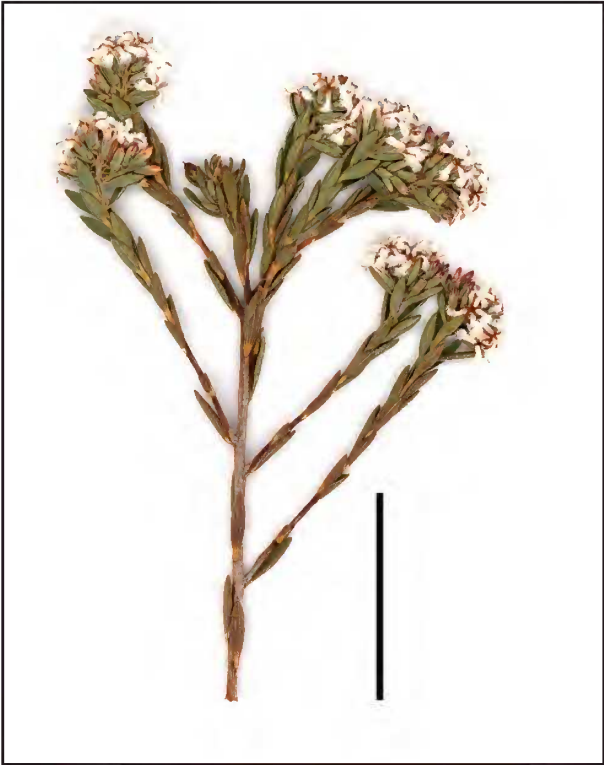
Figure 2. Leucopogon navicularis . Scan of flowering branchlet from M. Hislop 4117. Scale bar = 2 cm.